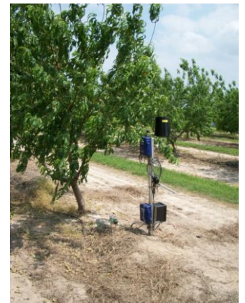
Figure 1 - Field Station automatically measuring and transmitting tensiometric soil moisture and other soil indices at various depths.

read manually or collected automatically and transmitted electronically (Figure 1). Detail information about these instruments, how they are used, and how to use the information they provide is readily available from many sources (e.g., instrument manufacturers, irrigation dealers, and University Extension personnel). [When possible, irrigation events